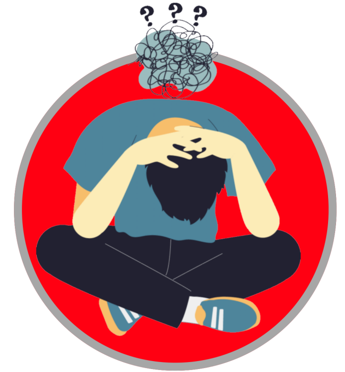
Lack of awareness of security policies and processes