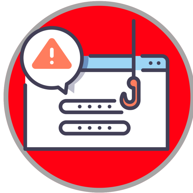
Employee falling for a phishing attack