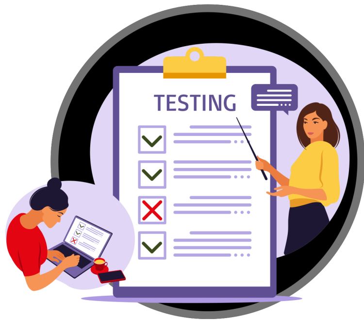
Security Awareness Training