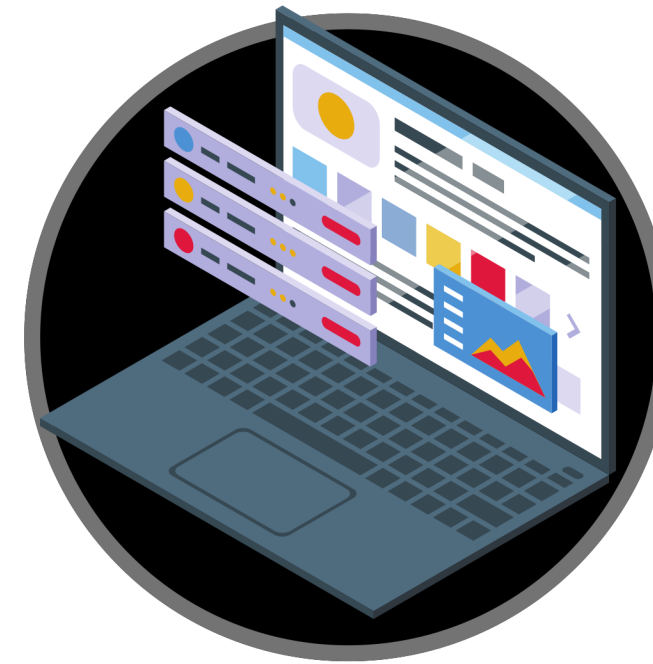
User friendly interface