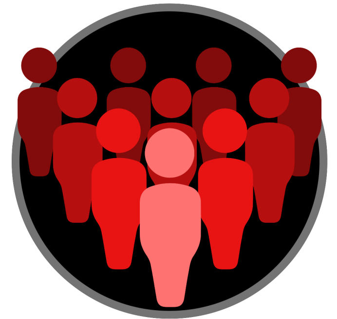
Human Cyber Resilience