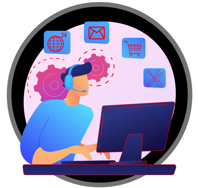
Round the clock support